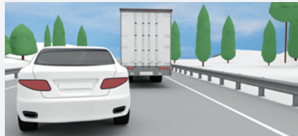
Blind Spot Warning/Lane Change Warning (BSW/LCW)