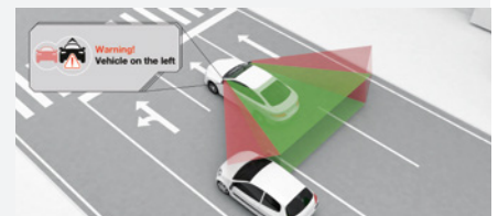
Control Loss Warning (CLW)