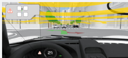
Left Turn Assist (LTA)