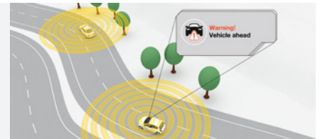
Forward Collision Warning (FCW)