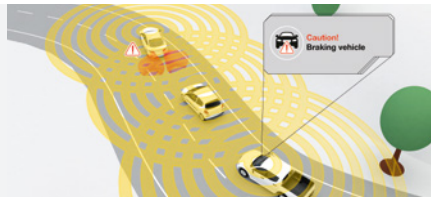
Emergency Electronic Brake Light (EEBL)